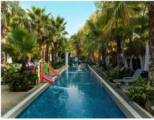
Children Pool 1

Main Pool; Technical details; depth 1.40 m, area 1800 m 2